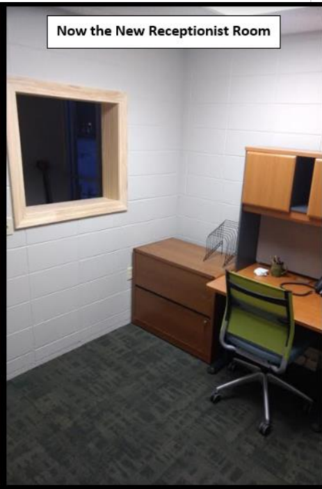
Now the New Receptionist Room