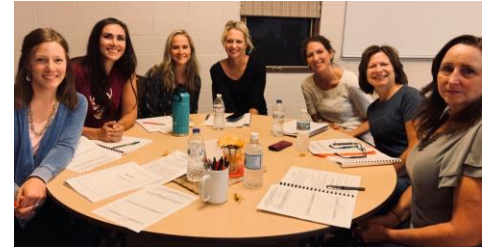
Crossview Church attendees at the September Discover Workshop

The Leader to Leader Network is offering individuals and teams an opportunity to discover their spiritual gifts, abilities, passions, to equip and empower you to make a significant difference in your life, your church, and the community.