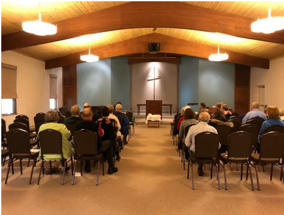
Love INC Stated Needs